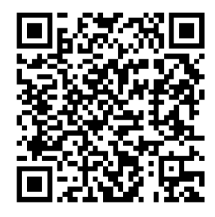
Donate $150 per student and become a PTA member

Visit one of the following https://www.cherrychasepta.org/e-store/links to pay by credit card. Note: The PTA uses PayPal as a payment processor, but a PayPal account is not required. Thank you for your support!